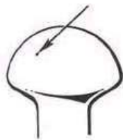
A Micron-Size Dust Particle on a Pin Head

Dust particles can be as small as a few microns (micrometers) or as large as hundreds of microns in size. The larger and denser particles tend to settle, while the smaller and lighter ones can remain airborne indefinitely.