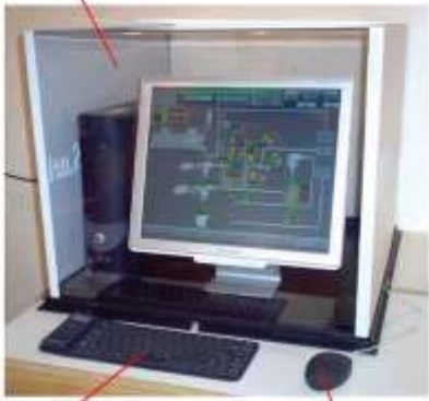
Dust-tolerant keyboard Dust-tolerant mouse

A drawback of using this approach is both the added expense of the dust case and specialized keyboard/mouse, as well as some difficulty in access to the less-frequently used devices such as the DVD/CDROM drive.